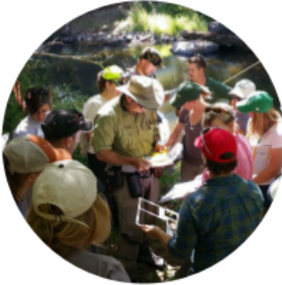
2015 Streambank Restoration Workshop